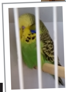
Best-in-show winner >